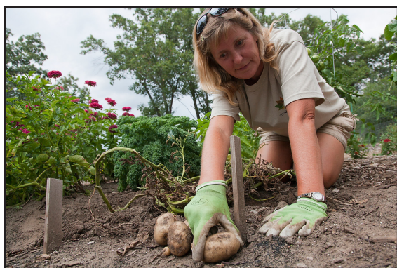
AND site

' Kennebec ' potato sets were selected based on their history of excellent yields, disease resistance and having large tubers. They are considered a midseason variety maturing in 80-100 days. The plants grow to 2-3' tall and 18-24" wide.