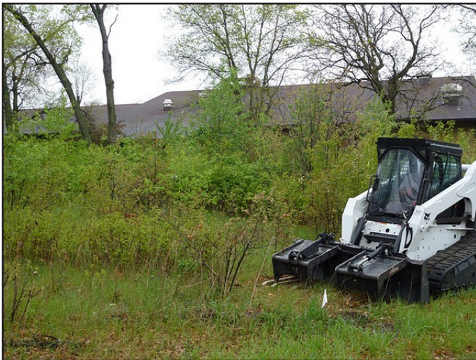
Andover site before renovation

Bunker Hills Park , Bunker Hills Activities Center, 550 Bunker Lake Blvd NW, Andover, MN 55304