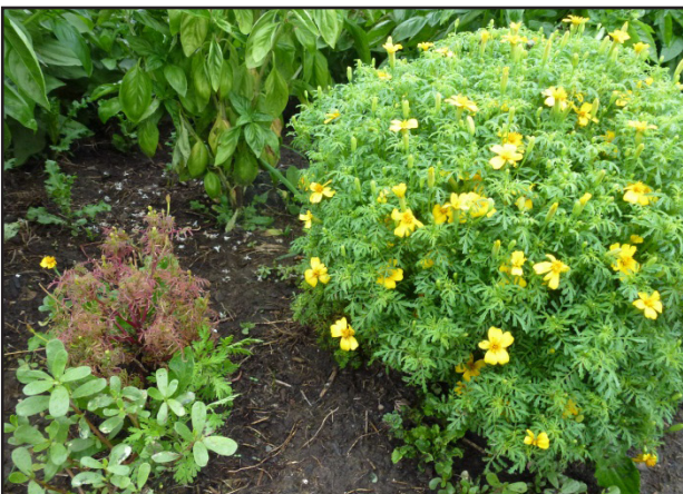
Aster yellows on marigold & weeds

Other challenges in the gardens included a plethora of weeds from Canada thistle to poison ivy. Japanese Beetles were prolific in the SPC and ARB sites. Aster yellows disease destroyed most of the marigolds and petunias in all three sites. Air temperatures were high most of the summer and moisture was plentiful early in the season, but soon ended in drought. The photograph below shows a marigold infected with aster yellows disease embraced by purslane next to a healthy marigold.