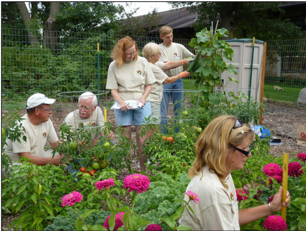
Volunteers at AND site

As we move into the next phase of our research, it will be valuable to compare across the four years slated for this project.