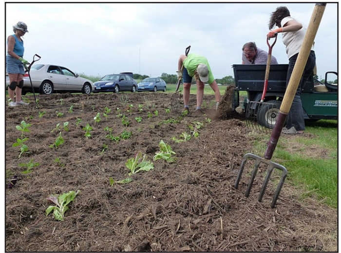
Planting day at St. Paul Campus site

The site was a former low-mow turf trial plot. The soil at this site is clay-loam. The sod was not removed but instead was tilled into the soil. The area where the garden is located is irrigated regularly. Planting day was challenging due to the wet clay and turf clods. The soil test in this garden recommended a nitrogen only fertilizer of 23-0-0, the same as the Arboretum site. Deer are not a problem at this site, but rabbits are, so a short fence was installed.