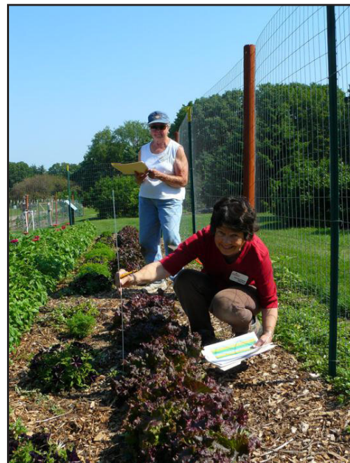
Volunteers collecting data at ARB site

Extension Master Gardener volunteers collected a variety of data over the season. Some of the data collected included weights and counts on crops such as potatoes, cucumbers and tomatoes, plus plant heights, plant widths, and bloom production. Results from that collection process follows.