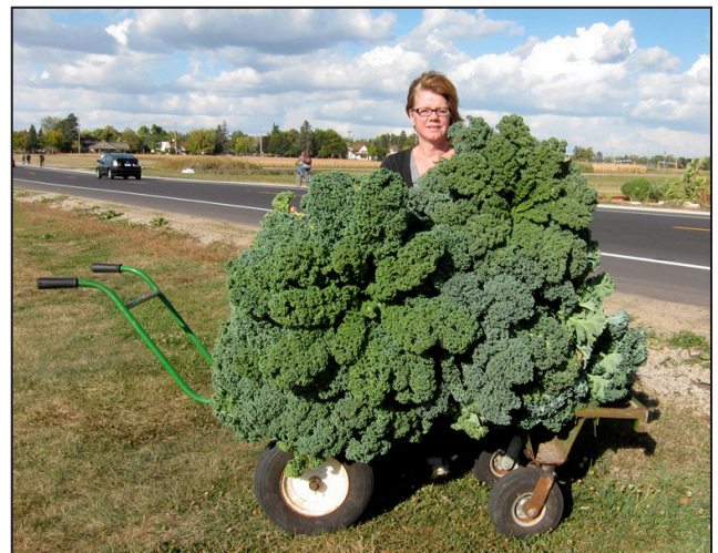
Kale harvest at SPC

Initially, the kale and Swiss chard were inter-planted for aesthetic reasons, but that resulted in overcrowding. It was decided to harvest the Swiss chard to give room for the kale for the duration of the season. There were six plants in each treatment.