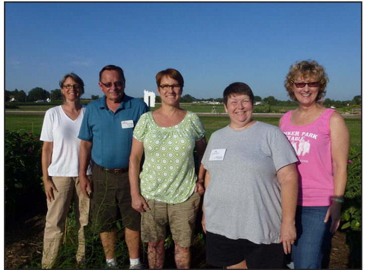
Master Gardener Volunteer Leaders

“The University of Minnesota Extension Master Gardener program is an internationally recognized volunteer program. It exists in all fifty states, in Canada and in the United Kingdom. Nationally, there are nearly 100,000 Master Gardener volunteers from all walks of life. They reach about 5 million people each year – the equivalent of more than $100 million in value to communities. In Minnesota, the Master Gardener program is coordinated by University of Minnesota Extension and has strong ties to the research and outreach of the Department of Horticultural Science.” ( http://www1.extension.umn.edu/master-gardener/about/ )