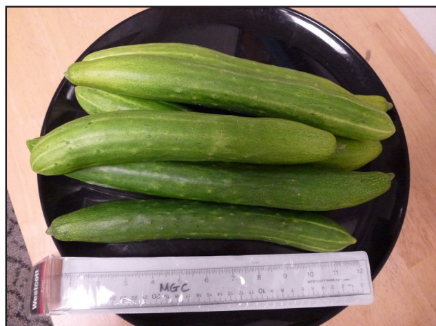
First cucumber harvest at AND site

The variety selected was Tasty Green Hybrid Cucumber. These were selected based on the description of being disease resistant, 9-10" in length and a good variety for trellises. The maturity date listed was 62 days. Seeds were started April 28th and were transplanted May 21-23 with the projected harvest date to be July 22-24 based on the transplant date and date-to-maturity.