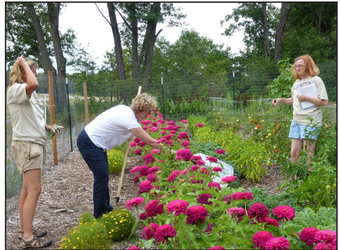
Zinnias at AND site

The SPC site showed the first bud break the week of June 23 in the CTRL and TRT 2 plots. By the next week the ARB site had bud break in all three treatments with TRT 1 showing a little stronger show. The AND site suffered early washout from a heavy rainstorm and struggled after that. Within the next few short weeks, the marigolds became very poor performers. At the ARB site there had been some early drought effects, plus damage from wildlife, possibly birds. Aster yellows disease became a problem in all three sites and plants were removed when symptoms appeared. Because of these issues, it was difficult to get viable data.