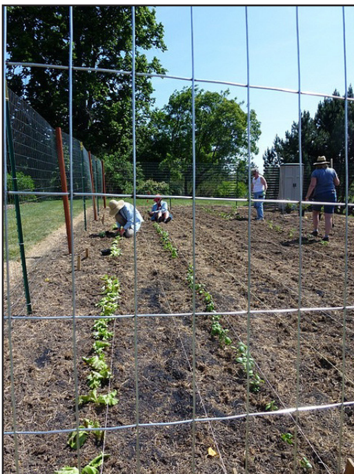
Planting day at Arboretum site

The soil structure in each site is uniquely different and it was anticipated that the results in each location would be quite different. Soil tests were also conducted at each site and the gardens were amended with fertilizer-only based on the recommendations of the soil tests.