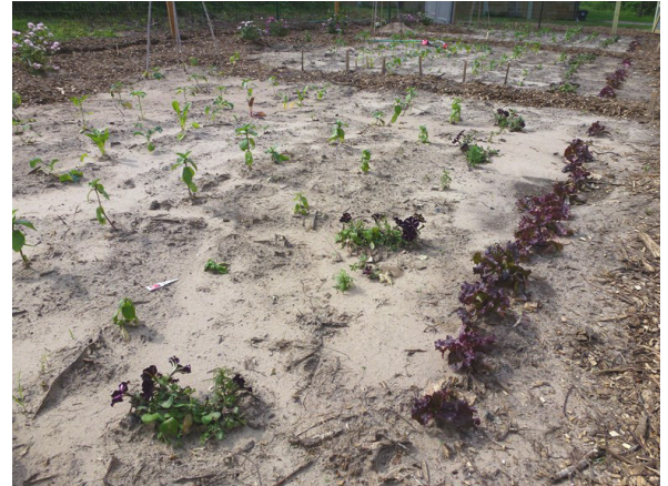
After the washout - AND Site

Red Sails Loose Leaf lettuce was selected based on its resistance to early bolting, tip burn and bitterness. This variety was a favorite AAS winner for salads forming large clumps approximately 10" across. The maturity date was listed as 40-45 days-seeds were started indoors. Based on that date of maturity the harvest date would have been July 1-3. Since that was a national holiday week and knowing many of our volunteers would not be available we opted to harvest during the week of July 14th.